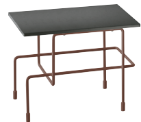
Indoor use Frame: Sepia Brown 5016 Top: Anthracite Grey