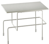
Outdoor use Frame: White 5011 Top: White Cataphoretically-treated version